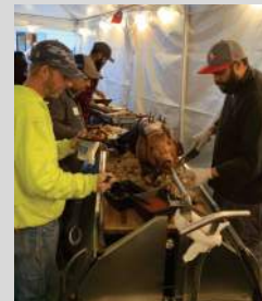
» Pictures from our 2019 Subcontractor Appreciation Open House Thank you to all Subcontractors, Suppliers and Vendors for a wonderful year!